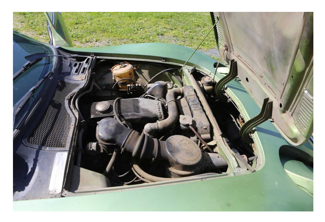
In June / July 2017 we disassembled the GT and prepared it for the painter.